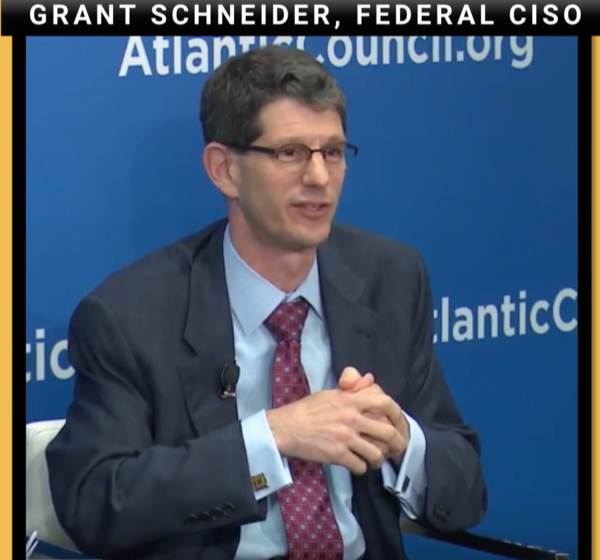
GRANT SCHNEIDER, FEDERAL CISO

"We have to move to where our data is far more aware and where our data is essentially helping to protect itself, so it knows where it is, who is trying to access it, and a lot of context around it so it can be protected..."